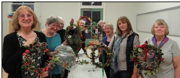
Alpha members demonstrate their Christmas wreaths.