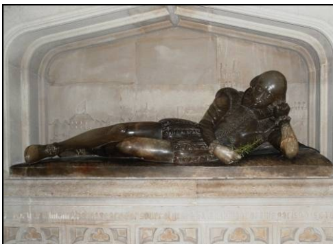
Memorial to William Shakespeare in Southwark Cathedral. He lived nearby when working in the Rose and Globe Theatres.