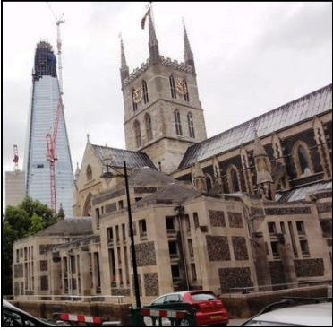
Cathedral and The Shard