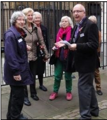
The start of our tour of Southwark Cathedral