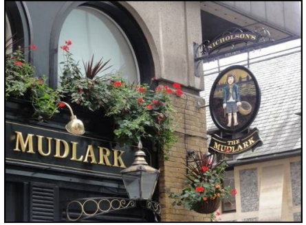
The Mudlark Pub