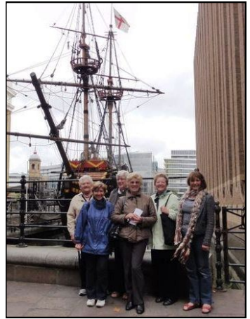
The group in front of the Golden Hind