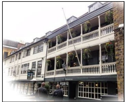
The George Inn