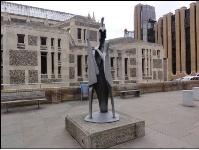
The Statue of Minerva