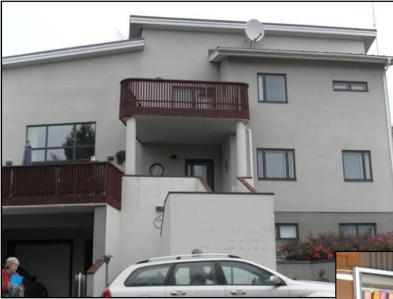
A beautiful example of Finnish design—plenty of room for a big family!

This is another beautiful piece of design—it's the phone booth in the Staff Room at Eija's school—can you see the transparent sides to cut out noise?