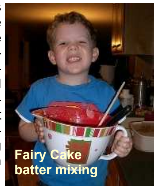
Fairy Cake batter mixing

Far too often parents become 'suckered' into buying the latest fad that teaches their child "x". While in America recently, I saw an advert selling a reading program that teaches babies as early as 3 months through toddlers to read. They play on parents' fears by stating, " Studies prove that the earlier a child learns to read, the better they perform in school and later in life. Early readers have more self-esteem and are more likely to stay in school. " ( www.yourbabycanread.com available at the URL accessed 27 November 2009). Parents spend $199.95 (or £199.99 from the website) for this program to get their baby reading before their peers. The market playing on our parental insecurities is huge. Products like this are not necessary to produce intelligent, well-adjusted children. An activity as simple as cooking with your kids offers so many teachable moments, counting, fine motor skills (chopping vegetables), patience, listening, following instructions, food groups... the list is endless, but how many parents actually take the time to cook a meal with their child? Yes, it might be frustrating at the beginning, but isn't everything at first? As the German writer Johann Wolfgang von Goethe said, 'Treat a man as he is, he will remain so. Treat a man the way he can be and ought to be, and he will become as he can be and should be'.