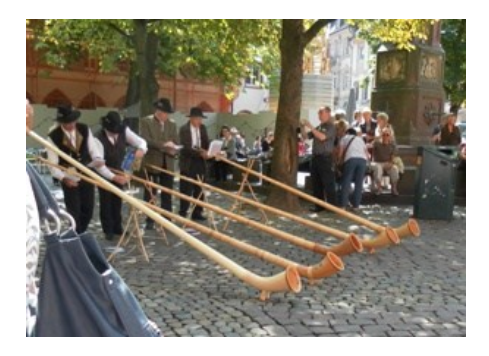
Never seen five alpenhorn before!