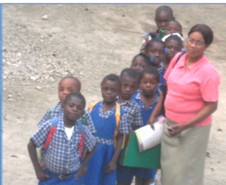
All 3 pictures: Working with Restavac children implementing teaching strategies

The charity is also involved with a juvenile prison and one adult prison. The juvenile prison accommodates 9 – 18 year olds: Some in for petty theft – for example stealing a pig or a chicken - others for murder, kidnapping, violence, etc. These children had an opportunity to attend English lessons twice a week. The teachers from the charity provide this education free.