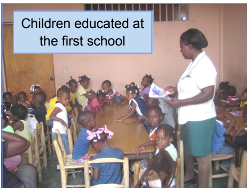
Children educated at the first school

Haiti is the poorest country in the western world and the third poorest in the world.