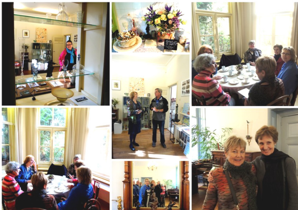
The European Forum Committee at work.