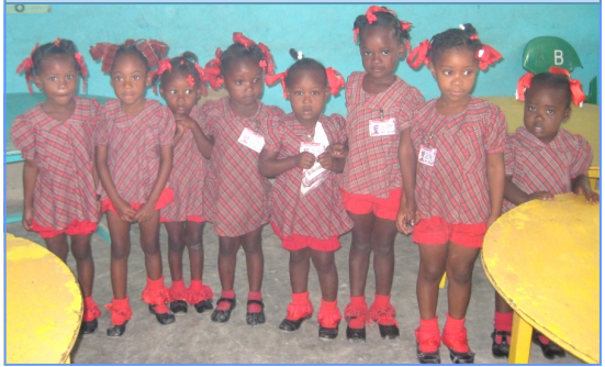
Children educated in the private school

My next assignment was to a privately-run school, four hours' drive from Port-au-Prince. Children aged 2 – 21 attended this school. The ninety children in the nursery were housed in one small classroom of approximately 24 square metres. Once again children remained in their seats throughout the session, apart from when they went out to play. The other classes had a minimum of 42 students in each class. This was a well-run long-standing school. All children had to reach a certain standard before they could 'move up' to the next level.